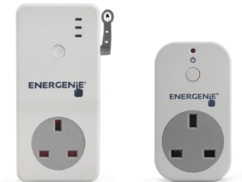
Figure 1(SMS Controlled Adapter)